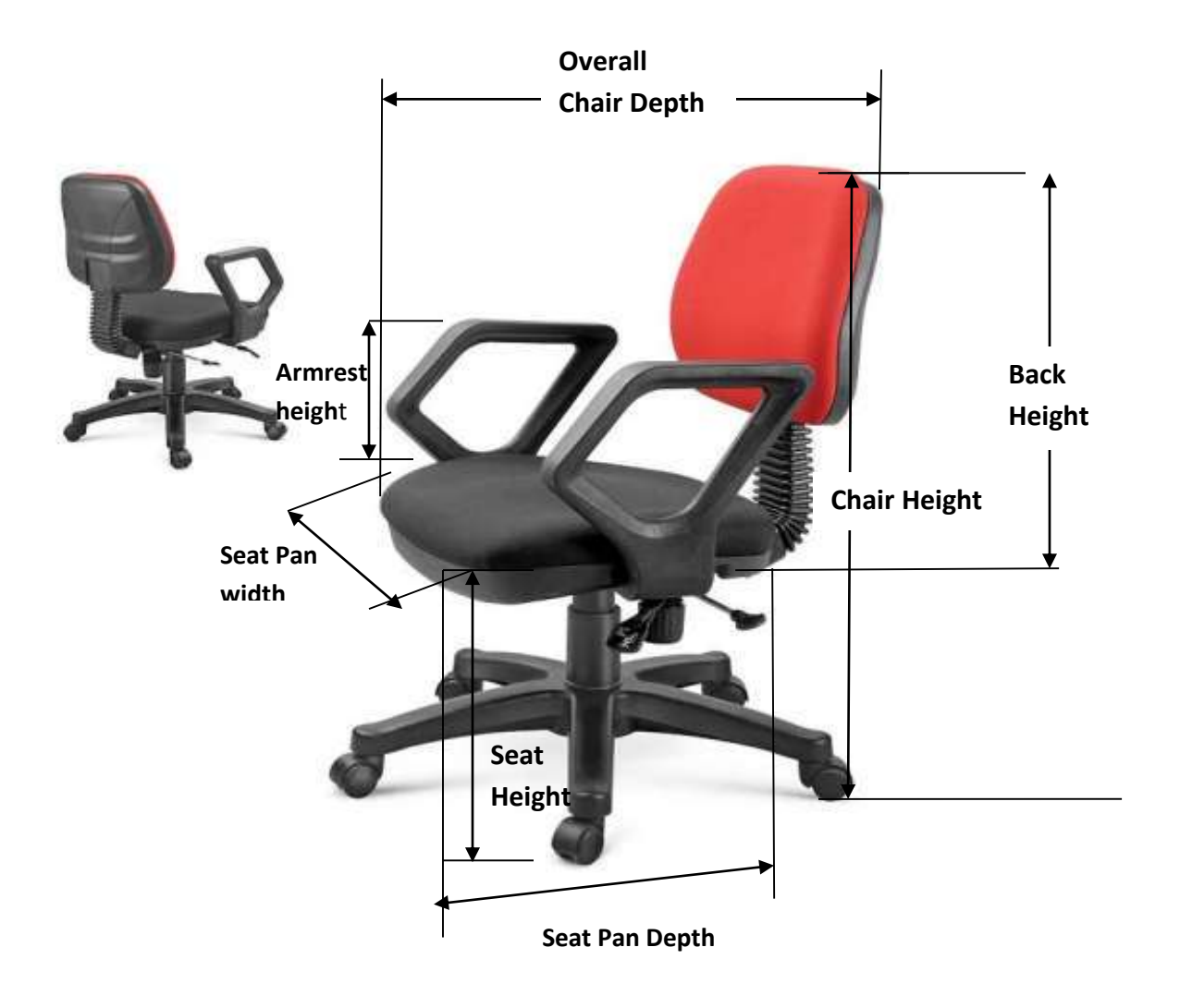
Figure 2a: Illustration of Seating Chair 1